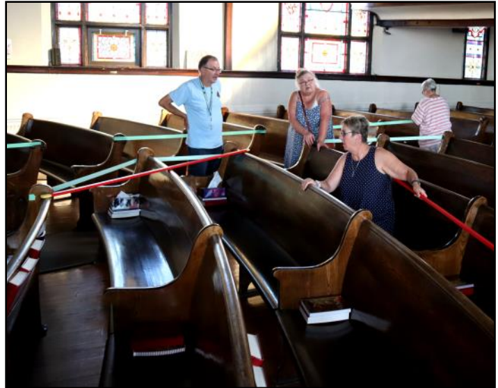
photo above: the Re-opening Committee examines possible “socially distanced” seating in preparation for a September resumption of in-church worship services.

Full details about the re-opening process, and what form the “new style of worship “